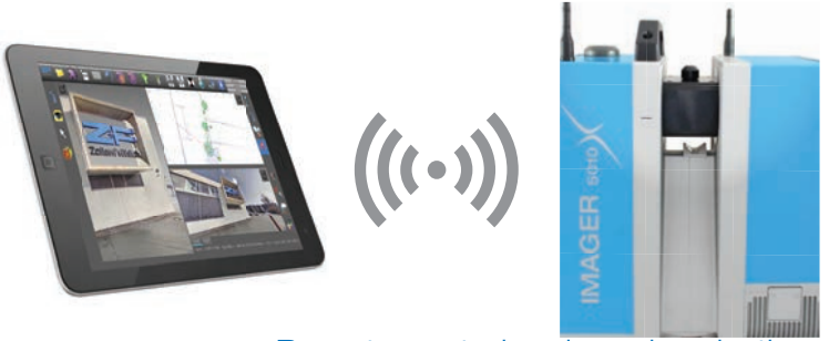
Remote control and synchronization

Z+F LaserControl<sup>®</sup> Scout will automatically synchronize all scan data locally and, after registration, update all scans on the scanner accordingly. Therefore, at any time, the scanner and tablet display the same results.