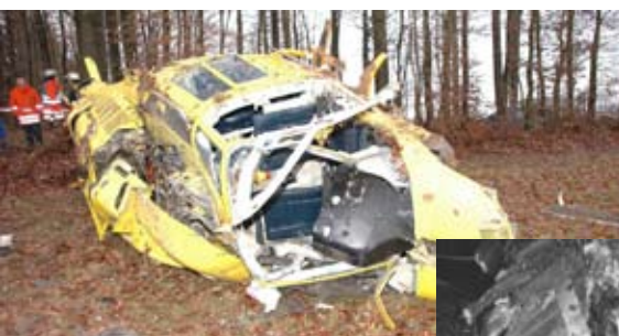
Helicopter crash Regional CID Baden-Württemberg

The protection class IP 53 means that the scanner is not affected by environmental influences. The low measurement noise guarantees a detailed and precise evaluation of the forest land.