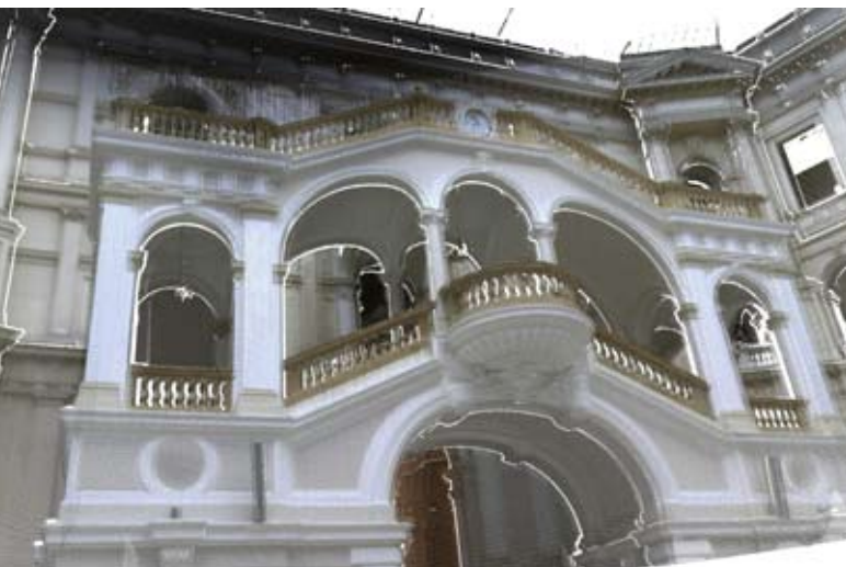
Colorized point cloud - Warsaw University

At the scene of an accident, for example, all the relevant data can be gathered very quickly without interrupting the work of the police or rescuer workers. Standstill times in production plants can similarly be reduced to a minimum.