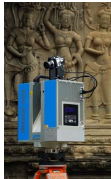
Explosion proof: IMAGER 5006EX