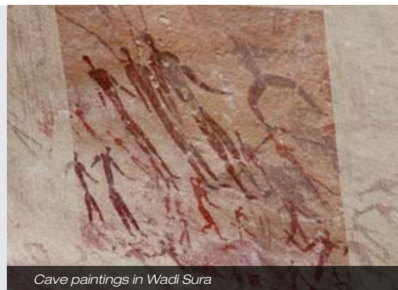
Cave paintings in Wadi Sura

Large areas can be mapped with only one or two scans, resulting in three-dimensional data which includes the smallest of details. The optional M-Cam can be used to capture colour information. Compared to conventional methods, much time can be saved. Unparalleled levels of precision can be achieved.