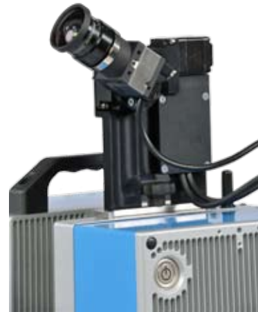
The M-Cam can be mounted effortlessly

The pictures are automatically associated with the respective scan and saved. The calibration data necessary for the camera is of course supplied as well.