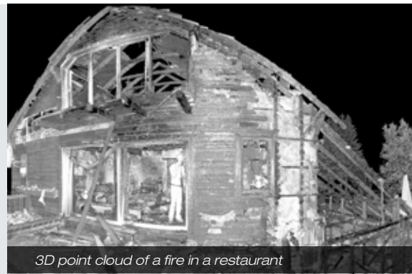
3D point cloud of a fire in a restaurant

Using the LFM software, the scenes can then be visualized afterwards. This leads to great savings in time when reconstructing an accident, checking plausibility where manipulation is suspected, and many other purposes in insurance.