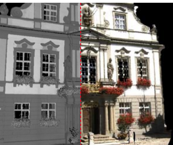
Colour mapping with M-Cam Wangen town hall