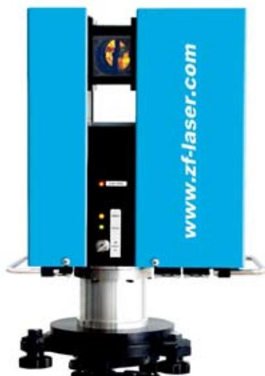
The first compact device: Z+F IMAGER 5003

In 2006, the success story of the IMAGER series was continued with the Zoller+Fröhlich IMAGER 5006. Thanks to its integrated control panel, powerful internal PC, hard disk and internal battery, the IMAGER 5006 was the first 3D laser measuring device where the stand-alone concept was realized 100%.