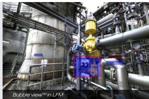
Bubble view™ in LFM

This enables a subsequent comparison between the revamp design and the as - built site. One other advantage is that the scanner can operate in a temperature range of -10° to +45°C.