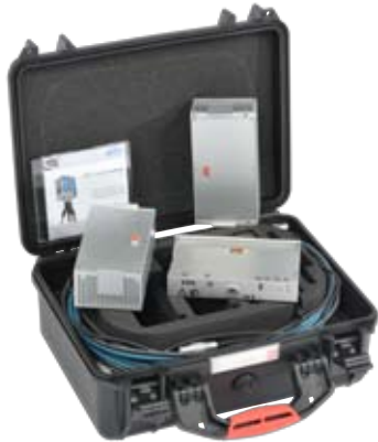
The stable case ensures the safe storage of the accessories

Every Z+F laser scanner comes complete with an accessory case that includes the following items: