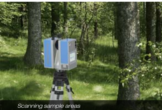
Scanning sample areas

The low degree of measurement noise means that despite long distances, a very high data quality and scan resolution can be achieved and even the smallest of details can be recorded.