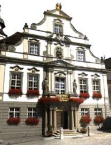
Wangen town hall in Allgäu in 3D view

The new Z+F IMAGER 5010 is highly precise, reliable and flexible.