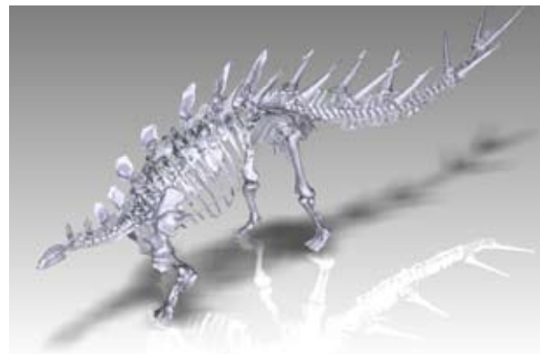
Complex 3D model used in palaeontological research

Having the protection class IP 53 means that the device is almost insusceptible to most environmental influences.